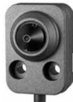
IP Camera (Actual size)